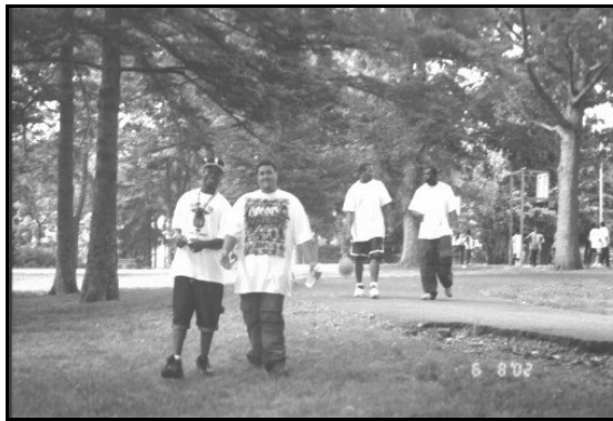
Roxborough & Ben Franklin end the year with a BBQ!

The day was marked by a partial re-enactment of the herculean battle on the gridiron between Roxborough and Ben Franklin last fall, where Roxborough prevailed mightily, but only because of a controversial incomplete pass which was ruled a fumble. Much friendly trash talk filled the air as the two teams finished up what didn't get settled last fall in games of football and basketball.