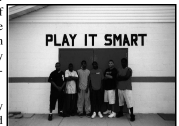
Play It Smart proudly displayed by Knoxville participants.

For many schools, the day culminated in a well-deserved cookout and a friendly game of basketball.