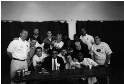
Austin-East and Fulton players with Coach Herman Boone.

His story was recently portrayed in the 2000 blockbuster hit Remember the Titans . Coach Boone was in town to be the keynote speaker at Knoxville’s Promise Youth Summit, an all day seminar and work shop that was held on March 11. Sixteen players from both schools were present from 9-12:30 to assist in the affair as part of a commu-